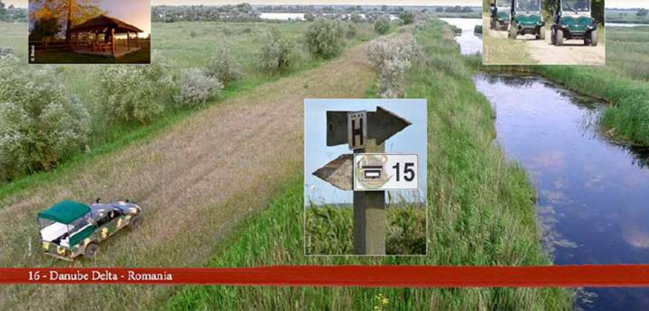
16 - Danube Delta - Romania